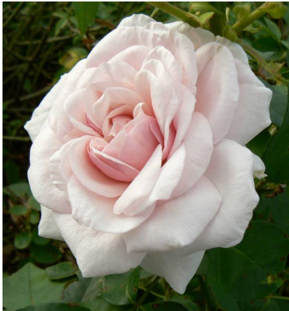
Mary Minor — Later Identified as Souvenir de la Malmaison