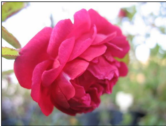
Louis Phillipe Rose

"They grow like ground cover, like shrubs, like hedges, they even grow up into trees," he told me. Some -- the polyanthas and chinas, in particular -- bloom all season. Others flower for only a few weeks in spring, and then, just to be difficult, break out in hooked thorns. Old rose fragrances are persistent, and their ability to survive disease and neglect is remarkable. And yet, as far as Mike could tell, most of the roses he found were headed for extinction.