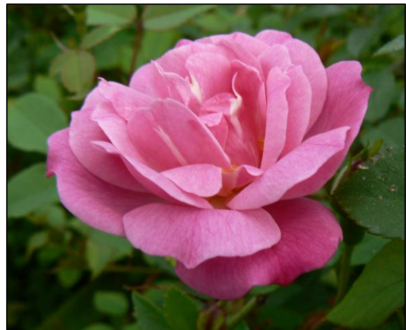
Old Blush

Margaret Sharpe, however, was not just any rose person. "Some people are in it to make collections, but not me," she states. "Some people are looking for a particular type of a