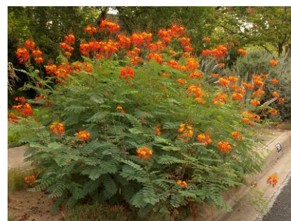
Pride of Barbados