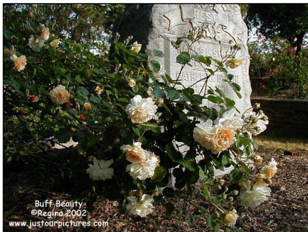
Buff Beauty Sacramento Old City Cemetery Historic Rose Garden