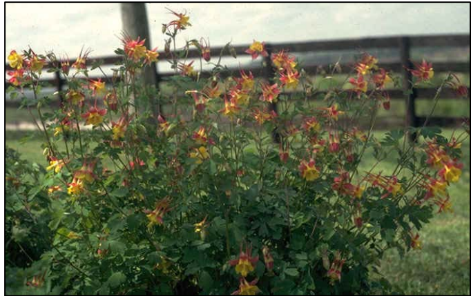
Blazing Stars Columbine (Aquilegia x puryearana 'Bernice Ilkins')