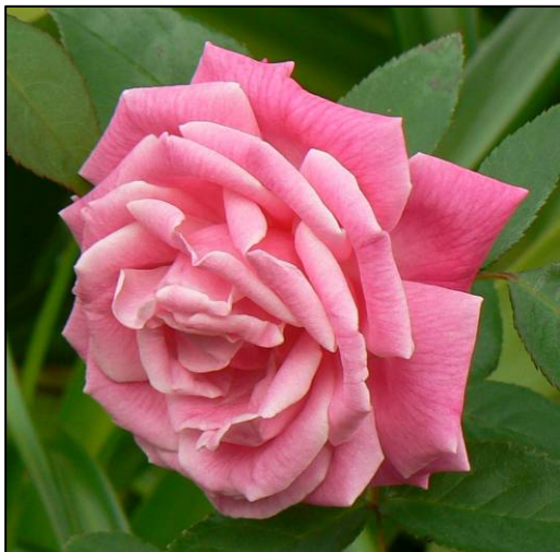
Pam's Pink