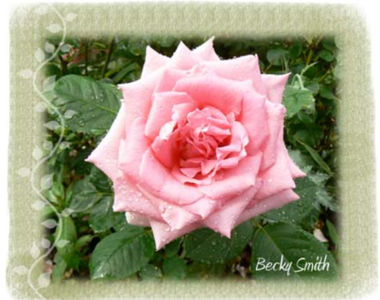
Aunt Honey, a Buck Rose, is just one of the roses that will be mentioned during the Buck Rose portion of RoseDango