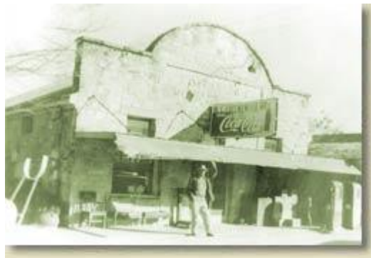
Independence General Store

On Saturday, the Texas Rose Rustlers will break for lunch and gather on the back deck of the Independence General Store for our cutting exchange and lotto . The store is right down the road from the Antique Rose Emporium.