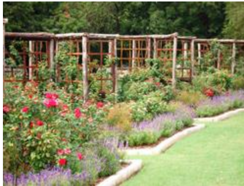
Farmers Branch Rose Trial Gardens