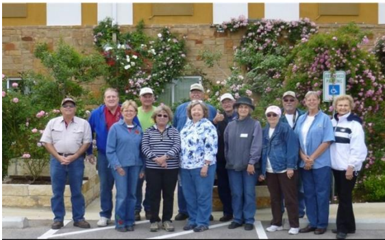
2013 TRR Group at Blanco