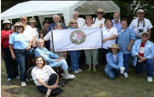
2010 (October) TRR at Rose Dango at Chambersville Rose Garden