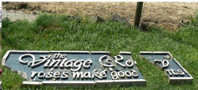
2009 Vintage Rosery Rescue