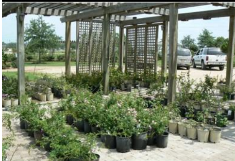
2009 Roses for Sale at the Vintage Rosery Rescue