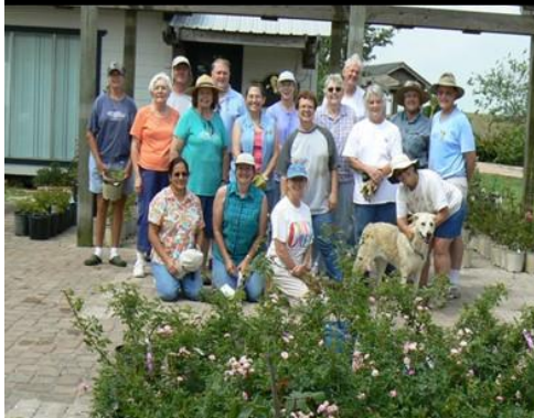
2009 Vintage Rosery Rescue: Group picture at the last workday on May 6