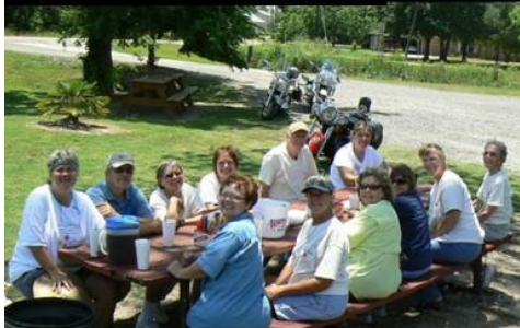
2009 Lunch at The Biker Bar during the Vintage Rosery Rescue