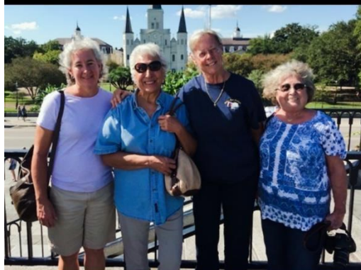
2019 April Visit to New Orleans Old Garden Rose Society