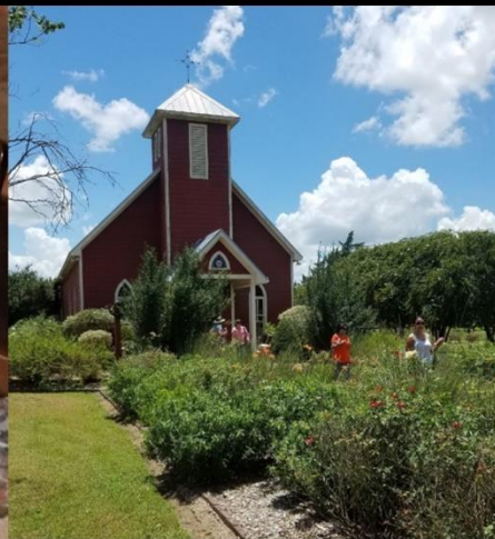
Antique Rose Emporium Chapel