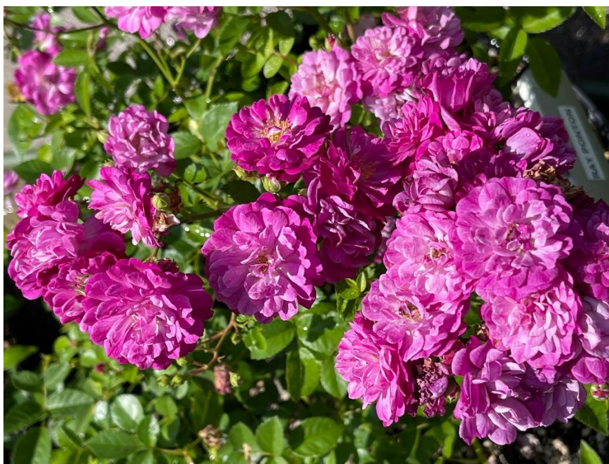
Rosa 'Ray Ponton'

It's been my pleasure serving on the board the last 13 years. Let's keep the spirit of the Texas Rose Rustlers going! Happy Summer!