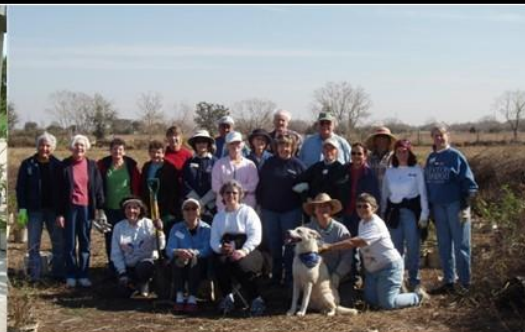
2009 (January 29) The Gang at Vintage Rosery