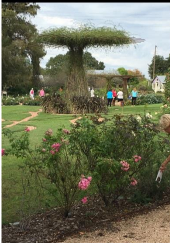
2015 Antique Rose Emporium