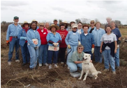
2009 (February 7) Vintage Rosery Workday