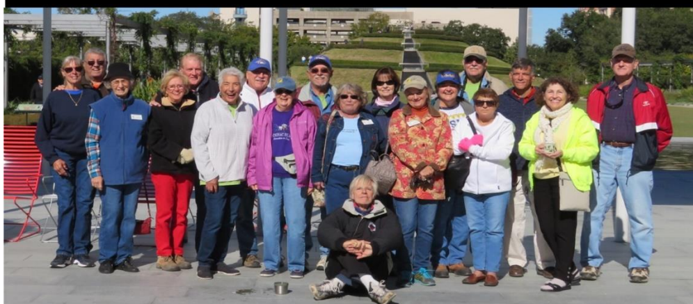
2017 (10.28) TRR Fall meeting at Hermann Park