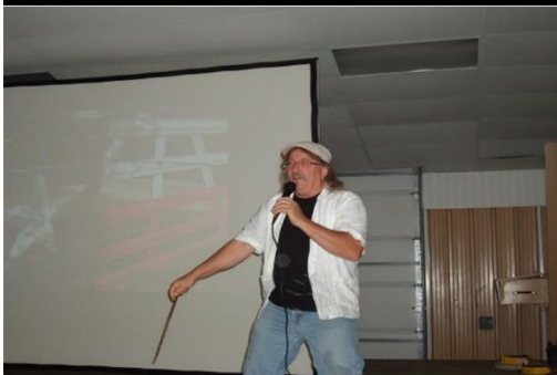
2011 Felder Rushing