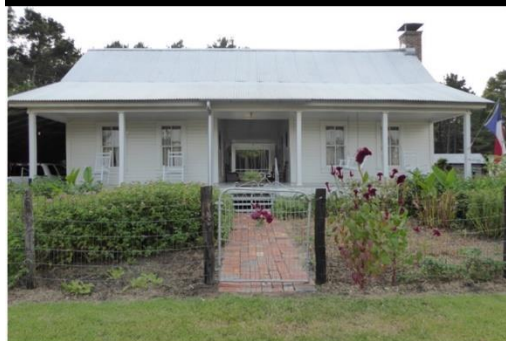
2015 Fall Meeting at Greg Grant's place