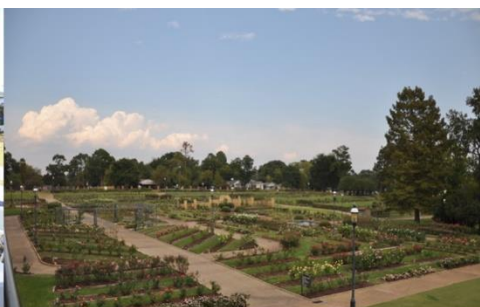
2015 Tyler Rose Garden