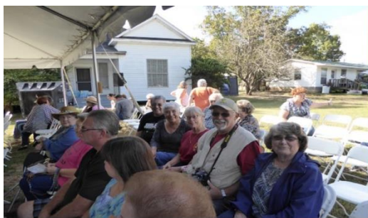
2015 TRR Group at King's Nursery 100 year celebration